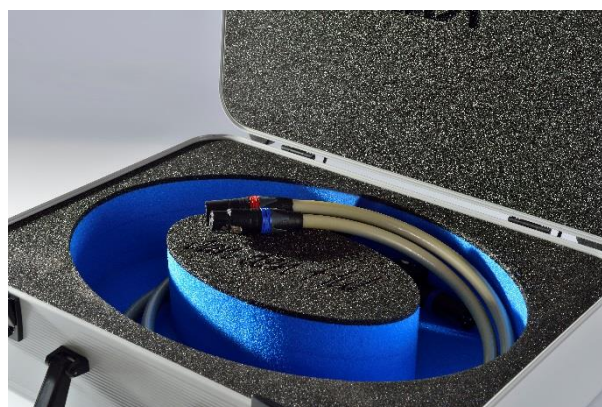
The Platinum Hybrid Mk II – Packed in original showcase