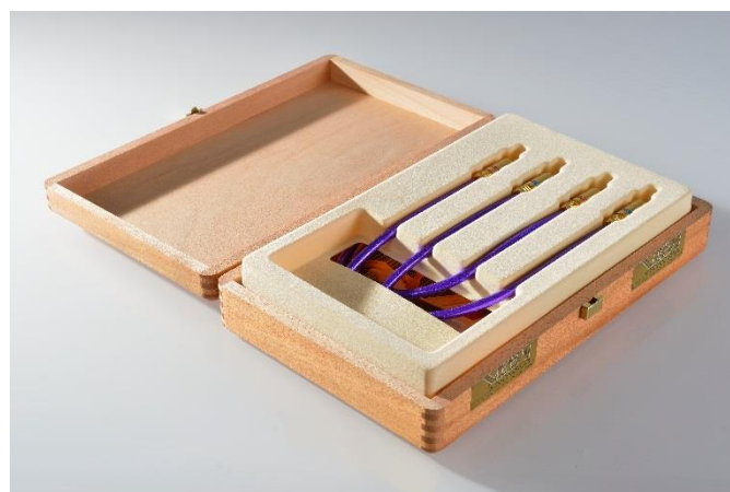
The MC Silver IT 65G – box packed