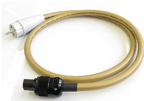
M.C. The Mainsstream Hybrid – mounted with Schuko – IEC connectors.