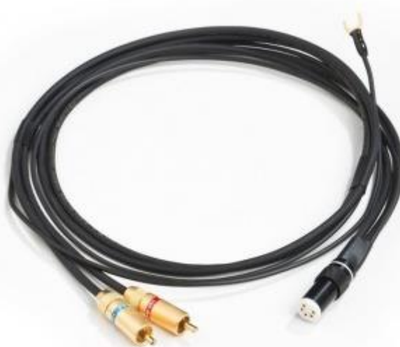
The D- 501 Silver Hybrid, mounted with RCA 4.0 and TAC connectors.