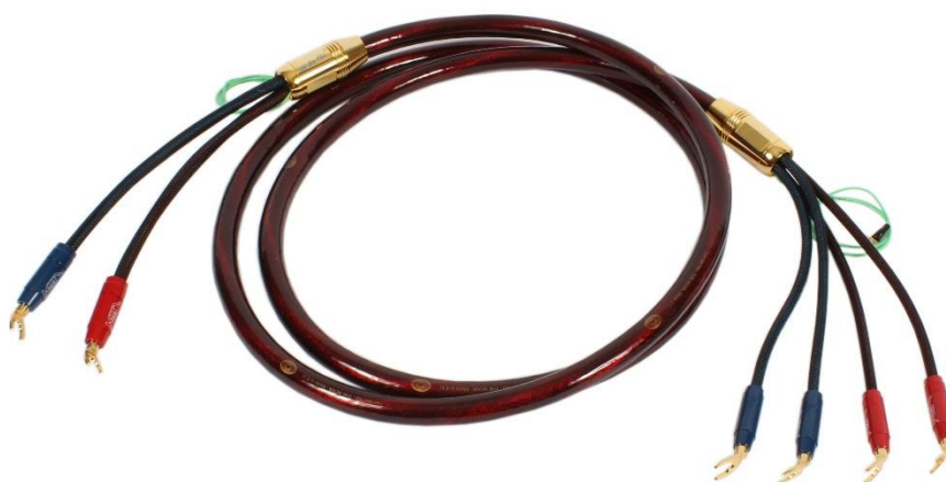
The Nova – Mounted as bi-wiring set with golden plated BERRI bus connectors