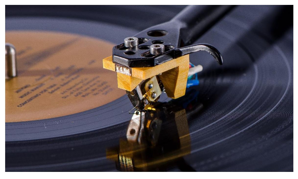
The Crimson – XGW Master Signature