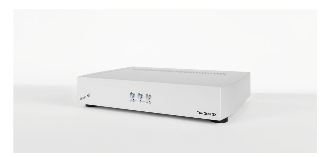
The Grail SX Amp

With this product, you are the owner of one of the most innovative and advanced phonograph preamplifiers available at the moment. It delivers fully balanced inputs and outputs. "The Grail SX" is a really dulcet phonograph preamplifier, specifically designed to bear ultimate performance and reliability in mind.