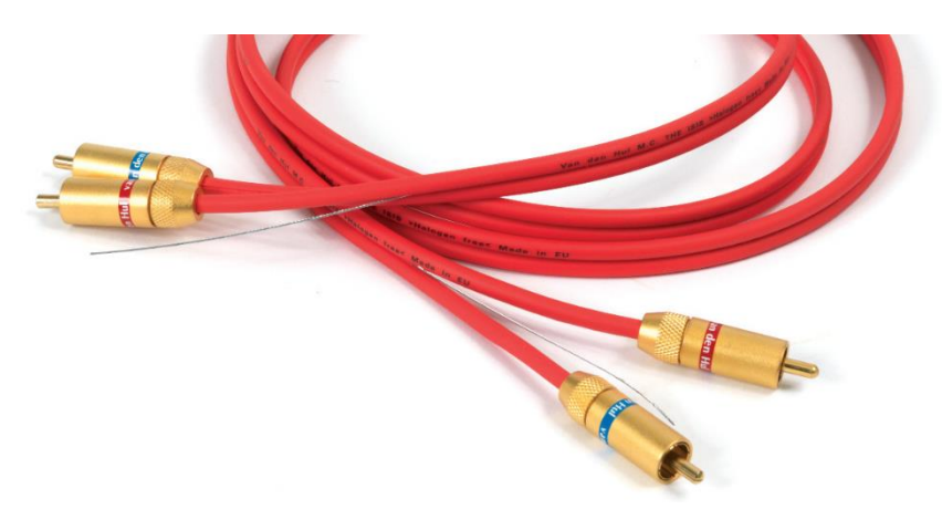
The Isis > Halogen Free < Made in E.U.