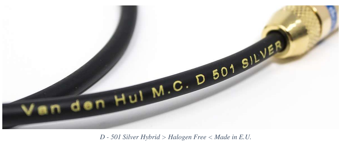
D - 501 Silver Hybrid > Halogen Free < Made in E.U.