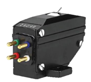
The MC – One Special

A thicker front pole and an extra magnet, to enhance the resolution capabilities and magnetic field of The MC – One Special