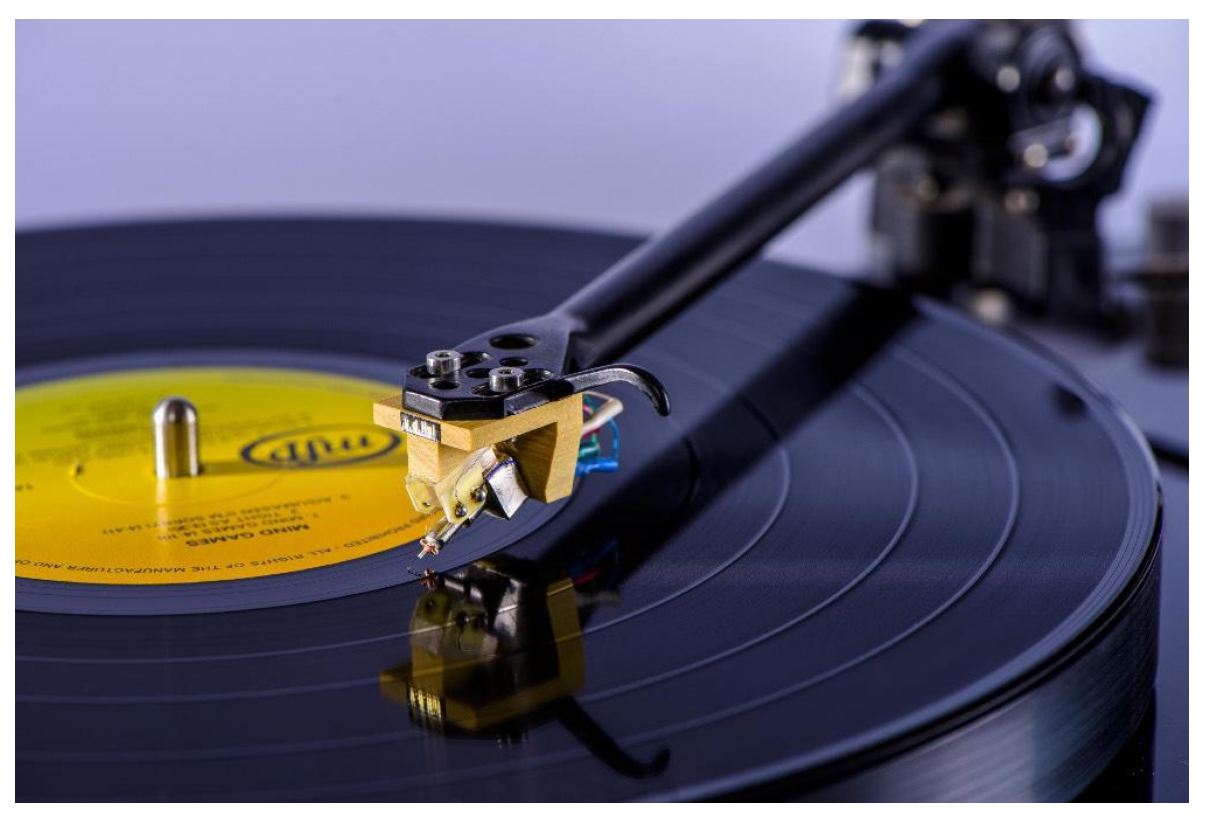
The Colibri XGW Master Signature