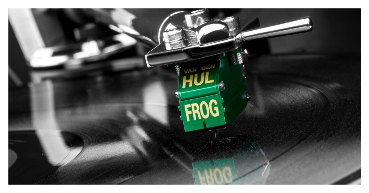
The Frog Gold